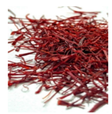
Figure 2: Saffron