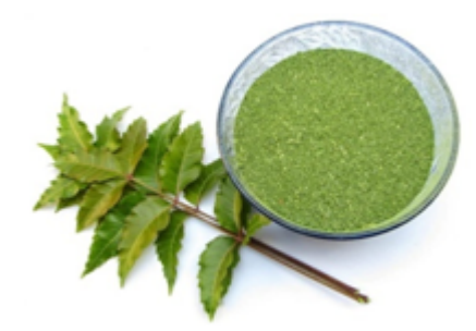
Uses:- Figure 3: Neem

Acne Treatment: Neem is endowed with potent antibacterial and anti-inflammatory qualities, making it an excellent natural treatment for acne. It fights acne-causing bacteria, diminishes inflammation, and alleviates the