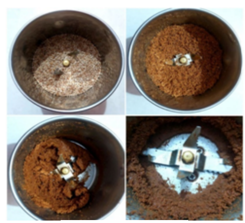
Figure 5: Sesame paste

First, roast the sesame seeds until they turn slightly brown. Then, grind them into a fine paste. Mix the sesame paste thoroughly. Then, we get a fine sesame paste with a brown color.