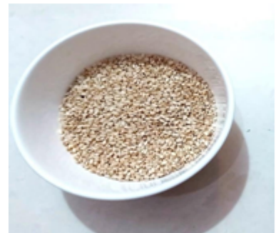
Uses:- Figure :1 Seasame